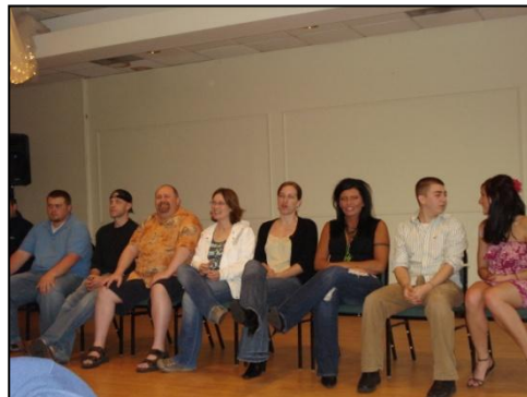
The scavenger hunt – lots of fun!