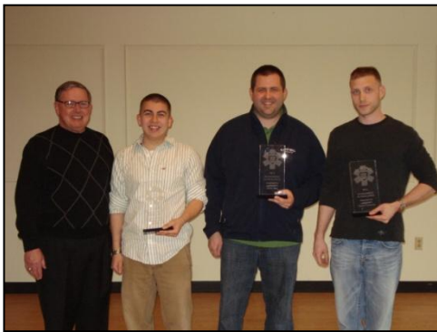
Achievement in Excellence Award winners