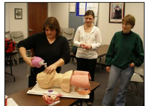
Learning how to help people breathe