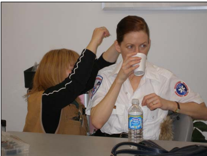
One of the main characters in the movie "Buick Rivera" gets her hair done and sips some coffee in our ready room before filming starts.