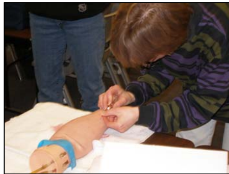
Ouch! Starting IV's on the dummy arm