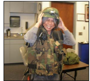
SWAT medic gear