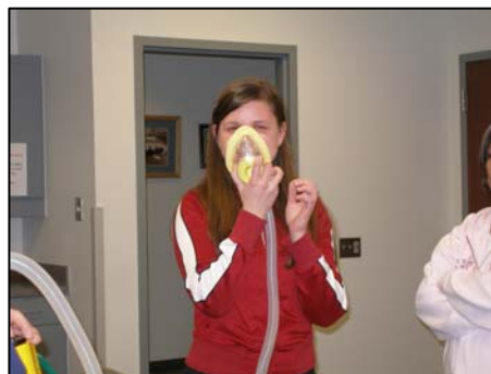
Trying out the CPAP machine