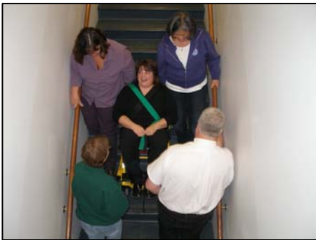
Learning how to use the stair chair

F-M Ambulance wrapped up its third Citizens EMS Academy on Wednesday April 11 th . The Citizen's EMS Academy participants enjoyed this hands-on opportunity to learn what F-M Ambulance paramedics and EMT's do every day. The Citizen's Academy helped teach skills that participants will be able to use in actual emergencies. Over an 8-week period, participants had the opportunity to ride along with paramedics and EMTs and go on actual emergency calls. The next Citizen's EMS Academy will take place in the fall of 2007. If you know anyone who is interested in being a part of the Citizen's EMS Academy, please have them check our website: www.fmambulance.com .