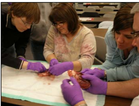
Cardiology lesson with pig hearts