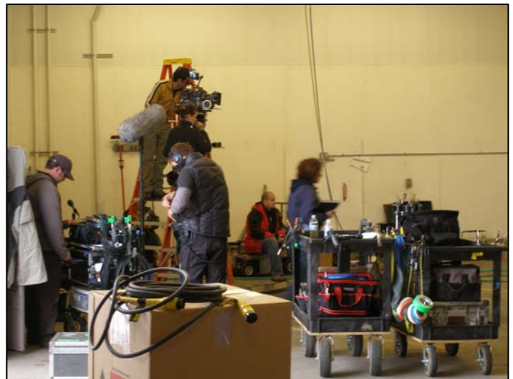
The crew gets ready to film in the garage.