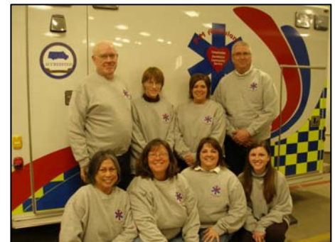
2007 Spring Academy participants