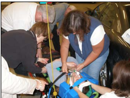
Extraction from a vehicle